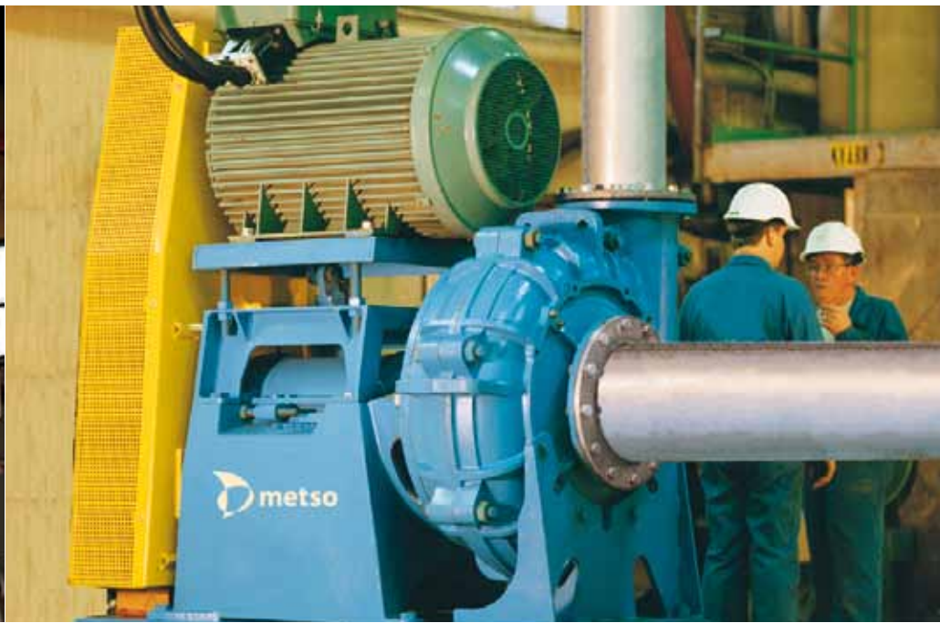
XM 600 with MM25 in the middle